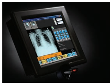
Remote Operations Panel

*Consult with your sales representative for the standard and optional features for specific Carestream products.